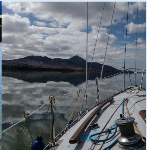
Ruff leaving Westport Quay with Croagh Patrick being reflected in still waters.