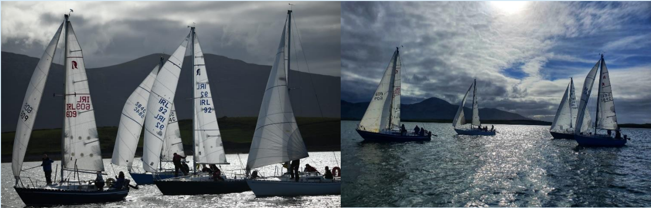
Selection of Photos from Ruffian Fleet Racing Event 2nd October 2022