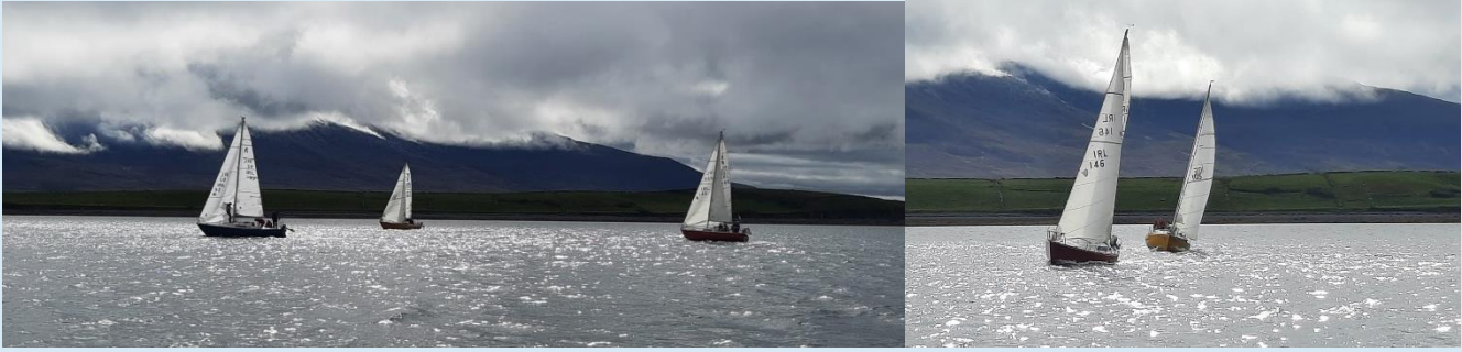
Selection of Photos from Club Team Racing 11 th September 2022