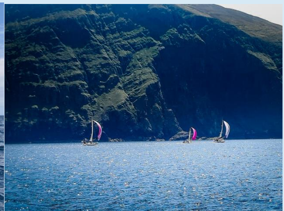
Wandering Angus between two MSCs cruisers under the sea cliffs of Clare Island