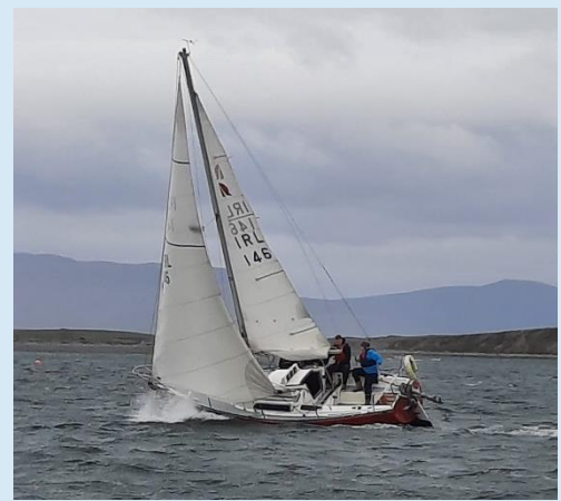
Selection of Photos from the Lady Helm Race Sunday 25 th September 2022